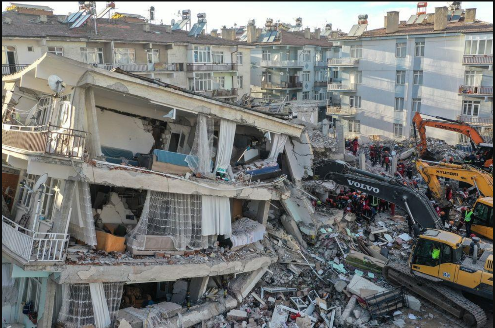
7.土耳其 - 大地震, 7. Turkey – Earthquake