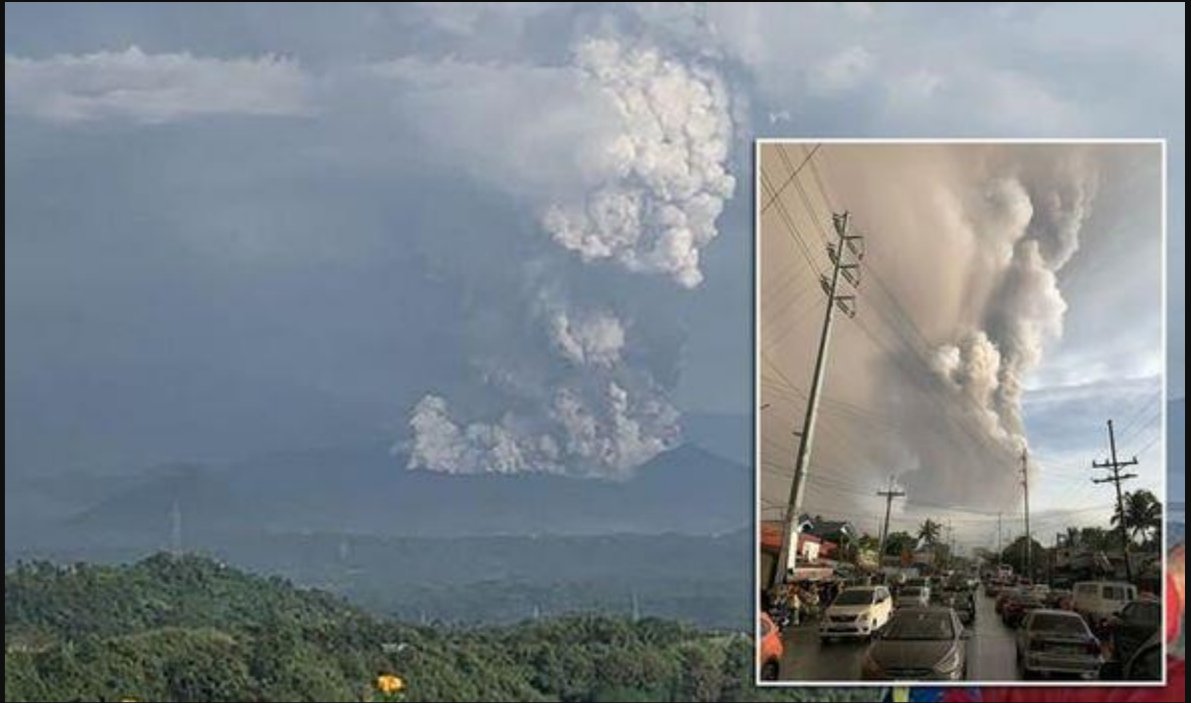
3. 菲律賓 - 塔爾火山爆發， 3. The Philippines – Taal Volcano Eruption